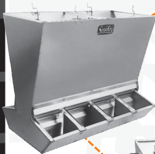
Finishing Feeder (Model 34236B)