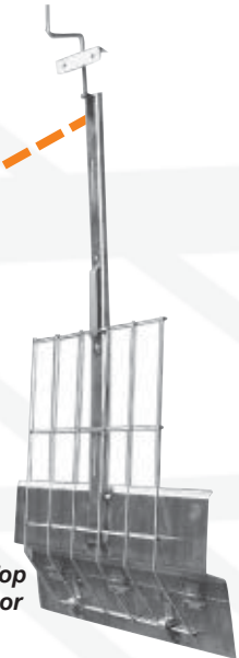
Easy Crank Top Adjust Agitator