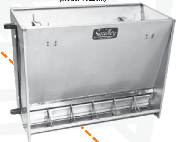
Nursery Feeder (Model 16228M)